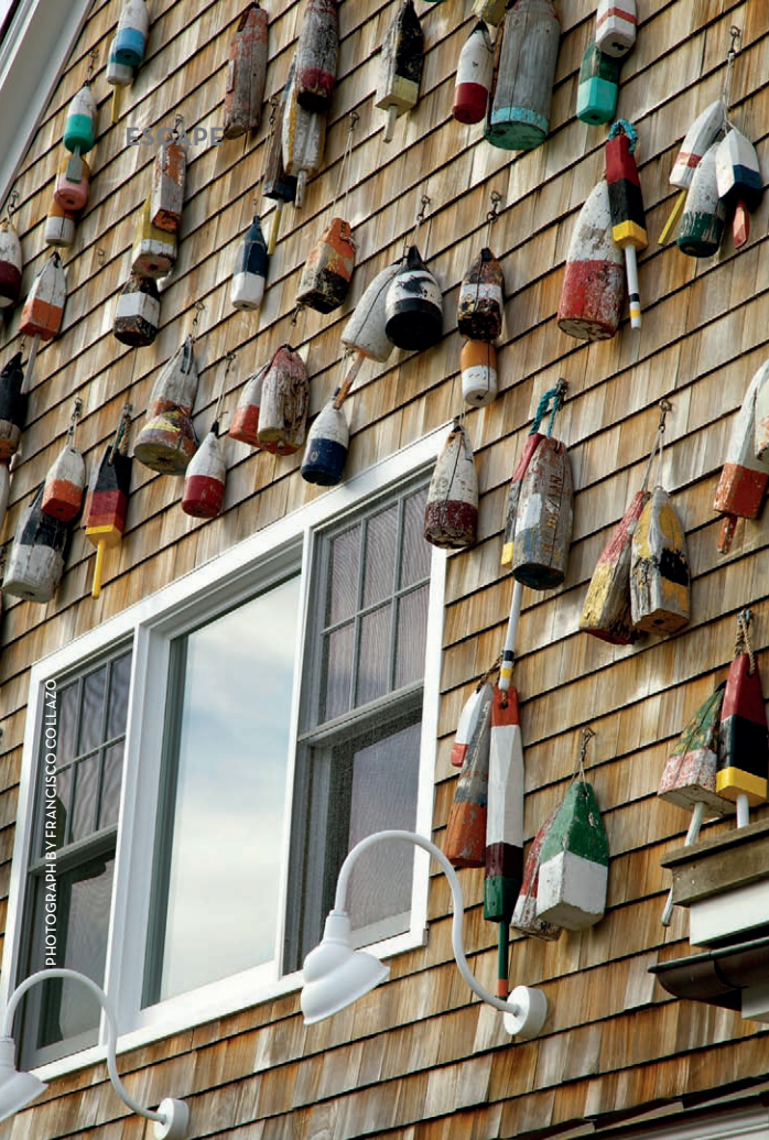
Beachcomber's souvenirs decorate the shingle on a harbour house.

if you're not so lucky, you are likely to see a familiar face during your visit. Author JK Rowling has spent some of her Harry Potter fortune on a home here, and Madonna, Billy Joel, Martha Stewart, Steven Spielberg and Jerry Seinfeld are a handful of the A-list names you'd recognise on mailboxes around town ... if their names were listed on mailboxes. Seinfeld's spread is particularly impressive, complete with a 22-car garage (and yes, it's full). Though they come here to retreat to their "cottages", celebrities are fixtures on the local social circuit and it's unlikely you'll return home without rubbing elbows with one or more of them.