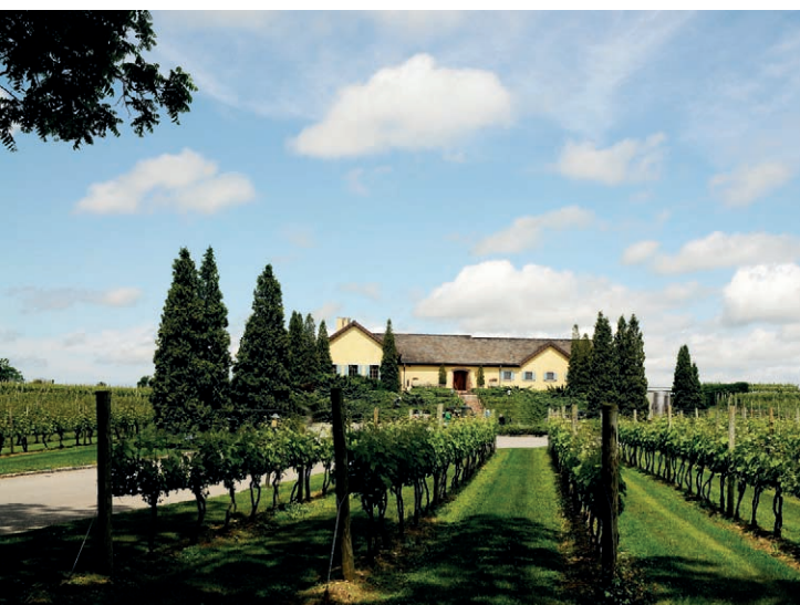
The well-kept vineyard at Wolffer Estate, the place to head at sunset for a chilled glass of wine.

Even if you don't have an invitation to an exclusive party, you can still get in on the action. Various websites and social networking groups have sprouted up recently to tip members off to events; you can register for free on a site like HamptonsUndercover.com in advance of your visit to receive VIP invitations. If that all seems like too much work, opt for a hotel bar, such as that at Surf Lodge in Montauk, which also offers live concerts to amp up the energy, or one of the area's popular nightclubs. Pink Elephant and The White House are local favourites. And don't overlook gallery openings, the annual ArtHamptons art fair, fundraisers and charity benefits; these are key to the Hamptons' social scene and are the easiest way for visitors to clink glasses with other movers and shakers.